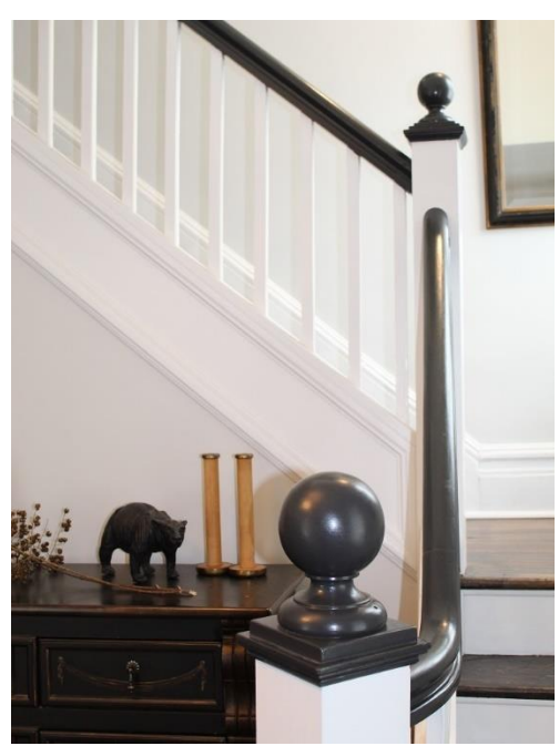
Photo Caption: 2020 Award of Excellence for "Best Historic Residential Renovation" to Main Street Custom Homes &

Remodeling, LLC from the Metropolitan Builders & Contractors Association of NJ.